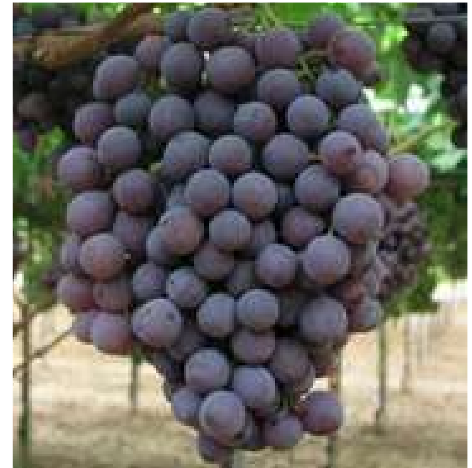
Apulia Rosa Seedless